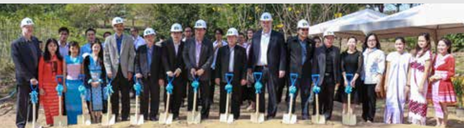
Hope Channel Southeast Asia team and university representatives at the groundbreaking service