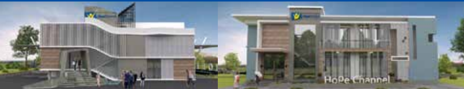
Architectural renditions of the new studios

January 25, 2017 Hope Channel Southeast Asia announced its plans to build its new studio and offices at a groundbreaking ceremony that gave God the glory and thanked the supporters who made this possible. The building will be built on the campus of Asia-Pacific International University (Thailand) where Hope Channel will be an integral part of the university's media ministry. The new building is expected to be completed by May 2018. 🙏